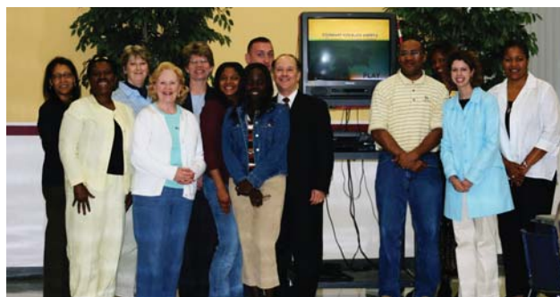
KSU Covenant's Book Discussion Group

The Resource Library also offers computer access, training videos, books, the Chronicle for Higher Education and much more! Come visit the Center and see for yourself!