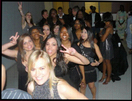
ISA 's International Fashion Show

“A journey of a thousand miles must begin with a first step” ~ Lao Tzu