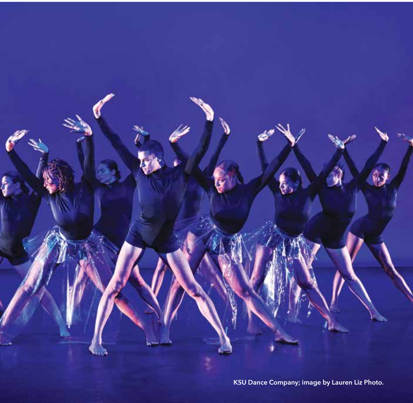
KSU Dance Company