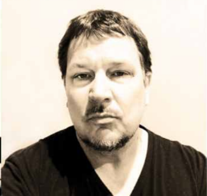
Band of Other Brothers will perform on Jan. 19, 2024; image courtesy of Band of Other Brothers.