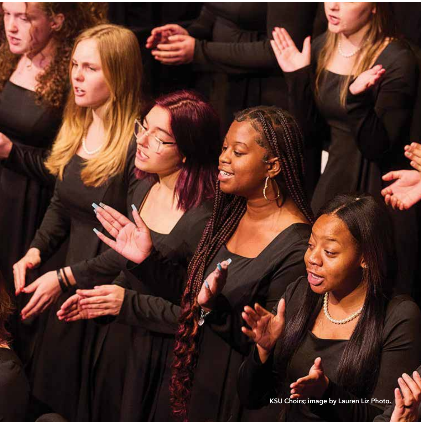
KSU Choirs; image by Lauren Liz Photo.