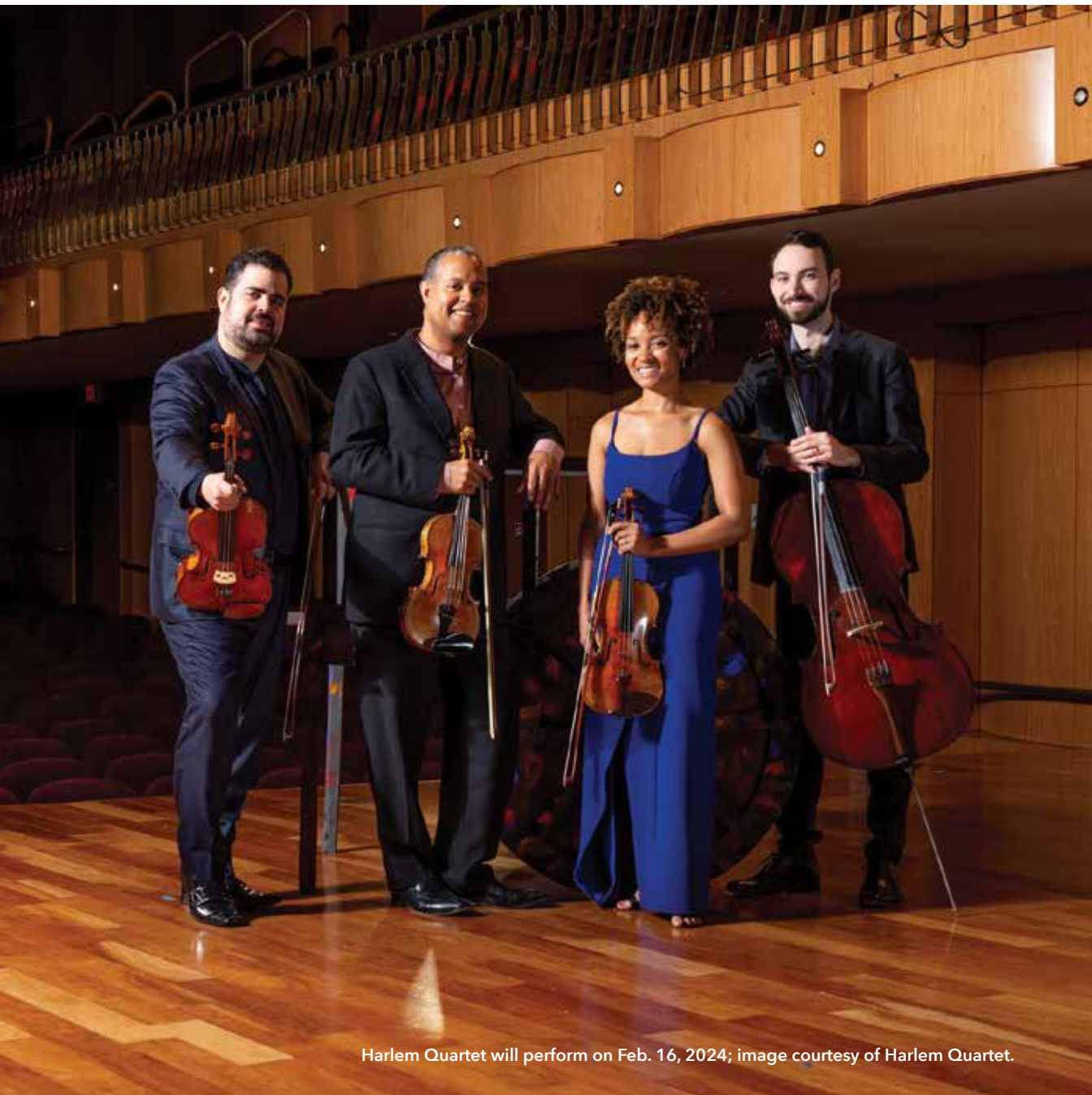
Harlem Quartet will perform on Feb. 16, 2024; image courtesy of Harlem Quartet.