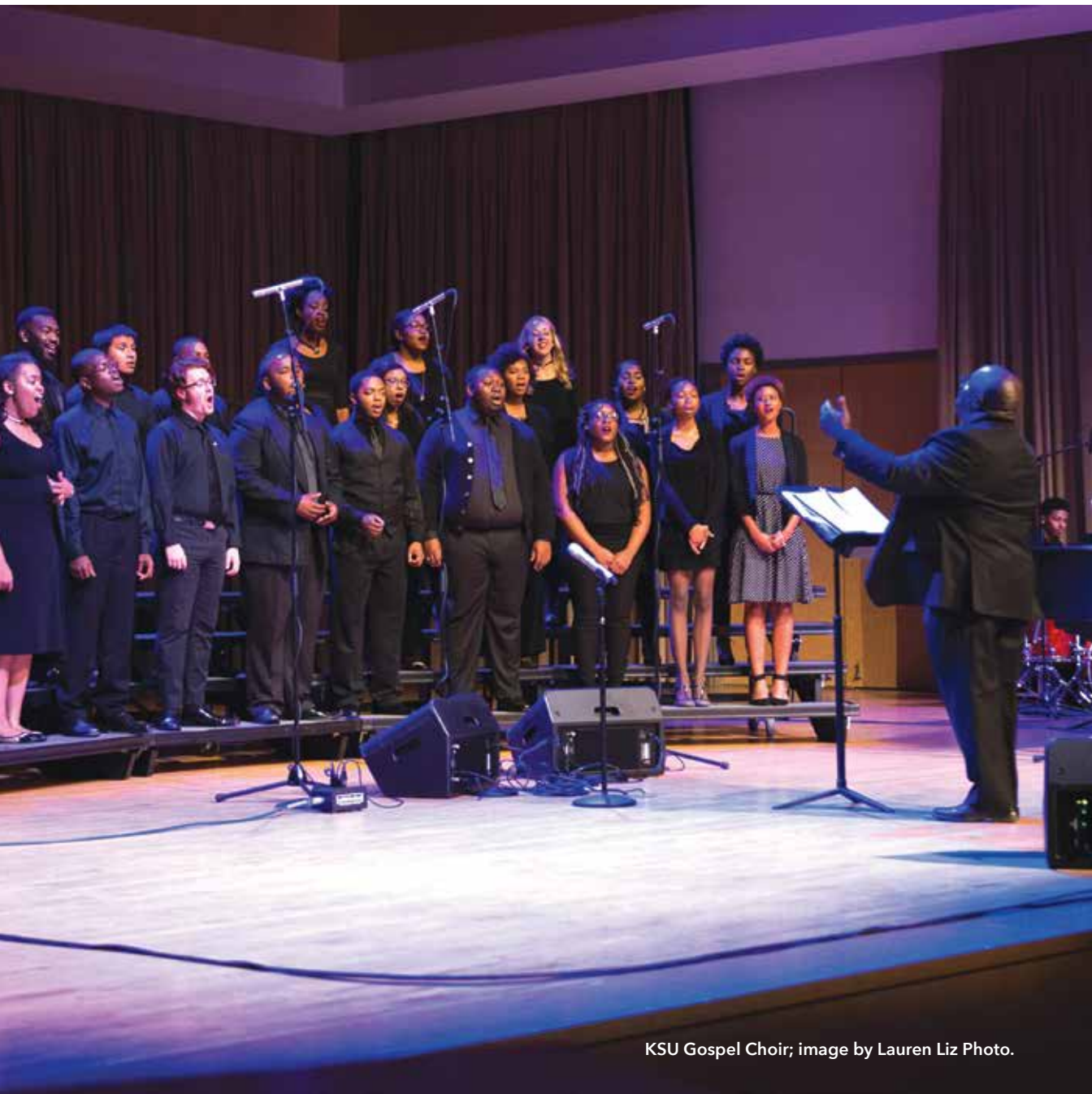
KSU Gospel Choir