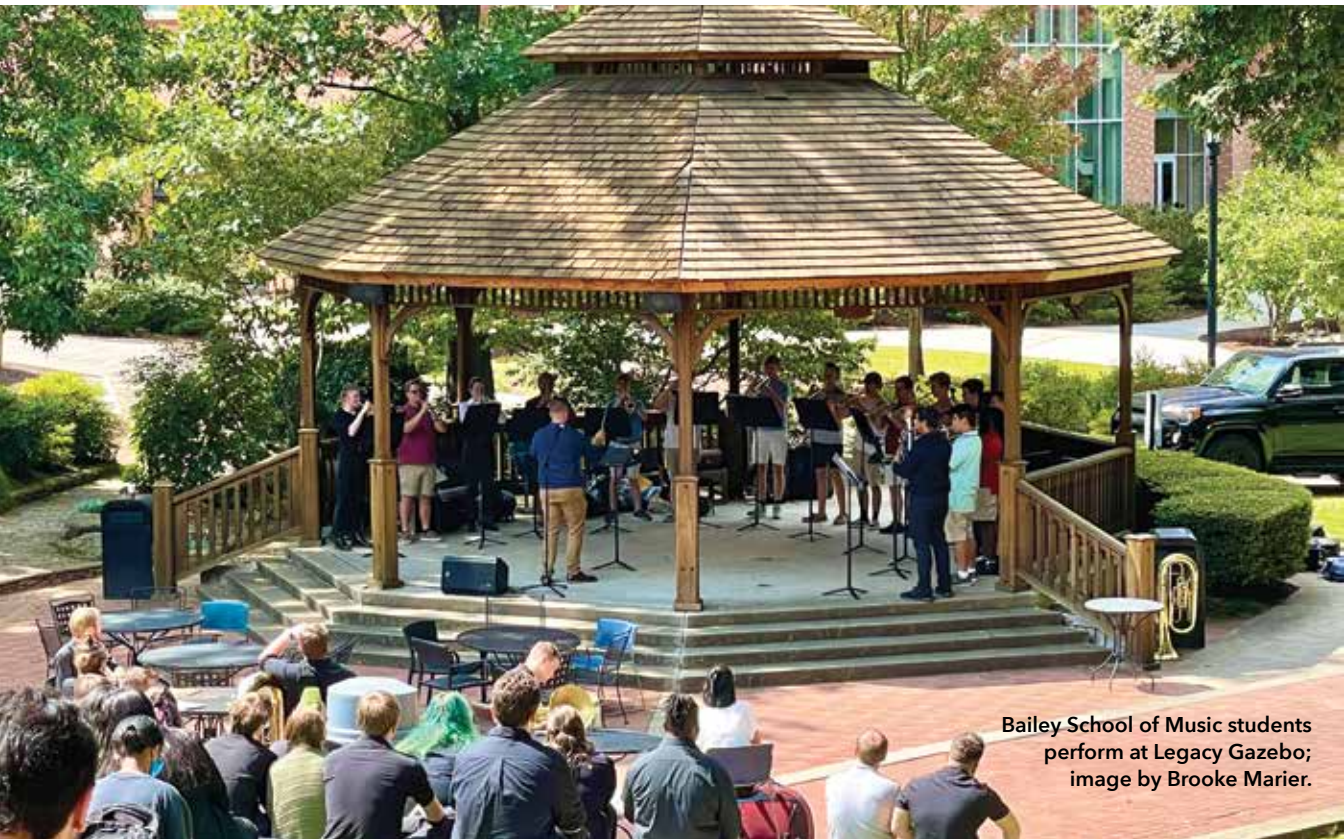
Bailey School of Music students perform at Legacy Gazebo

Enjoy a short program of music performed by Bailey School of Music students and faculty in a relaxed and beautiful setting.