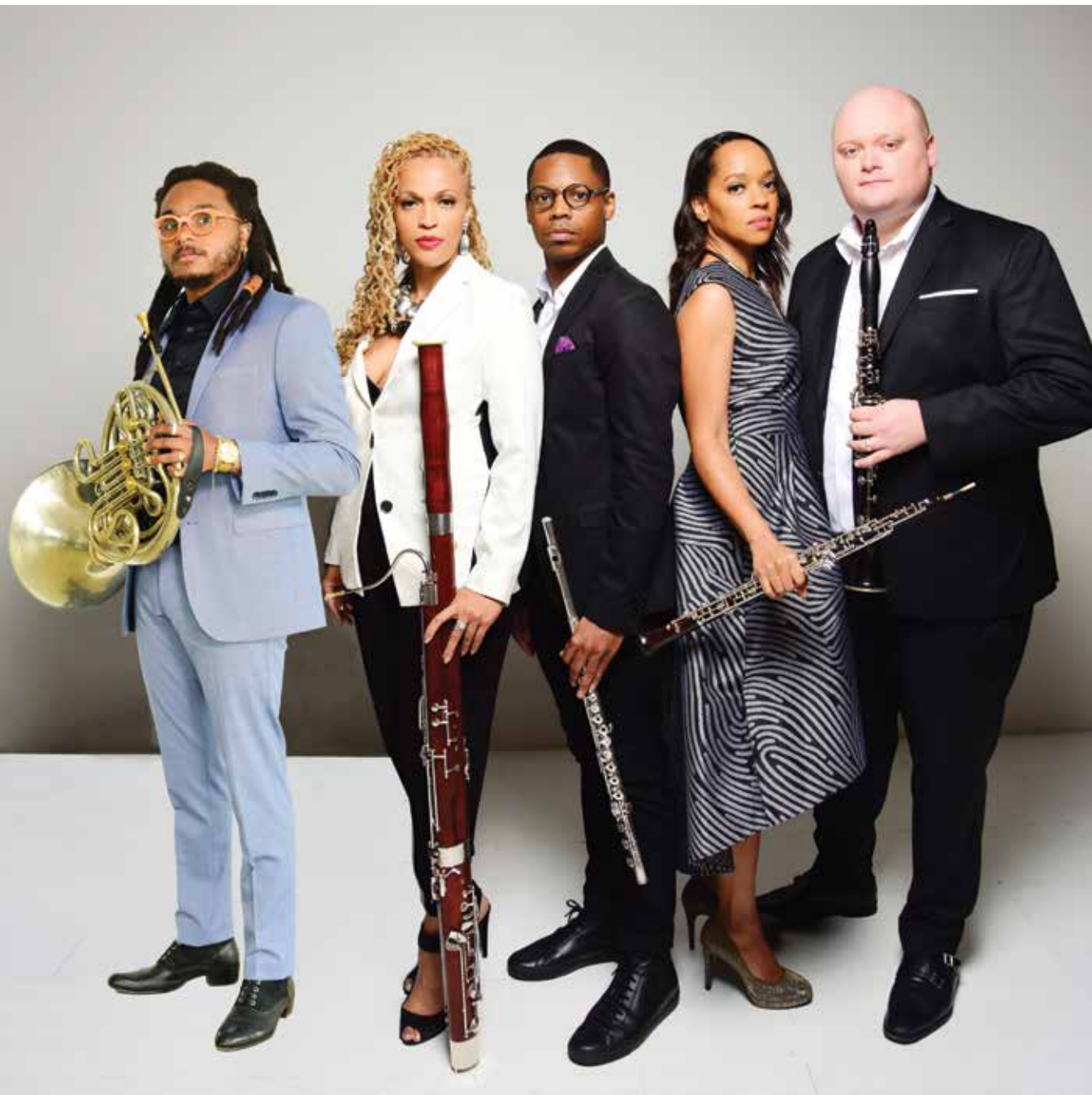
Imani Winds will perform on Sept. 29, 2023; image courtesy of Imani Winds.