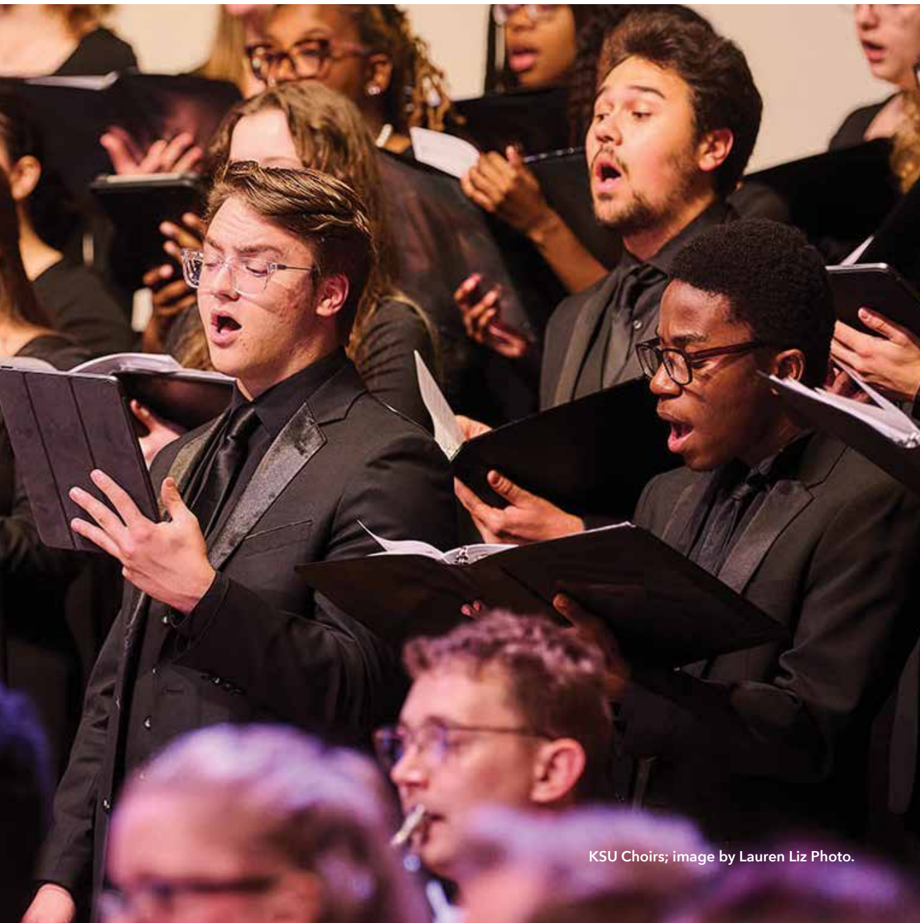
KSU Choirs; image by Lauren Liz Photo.