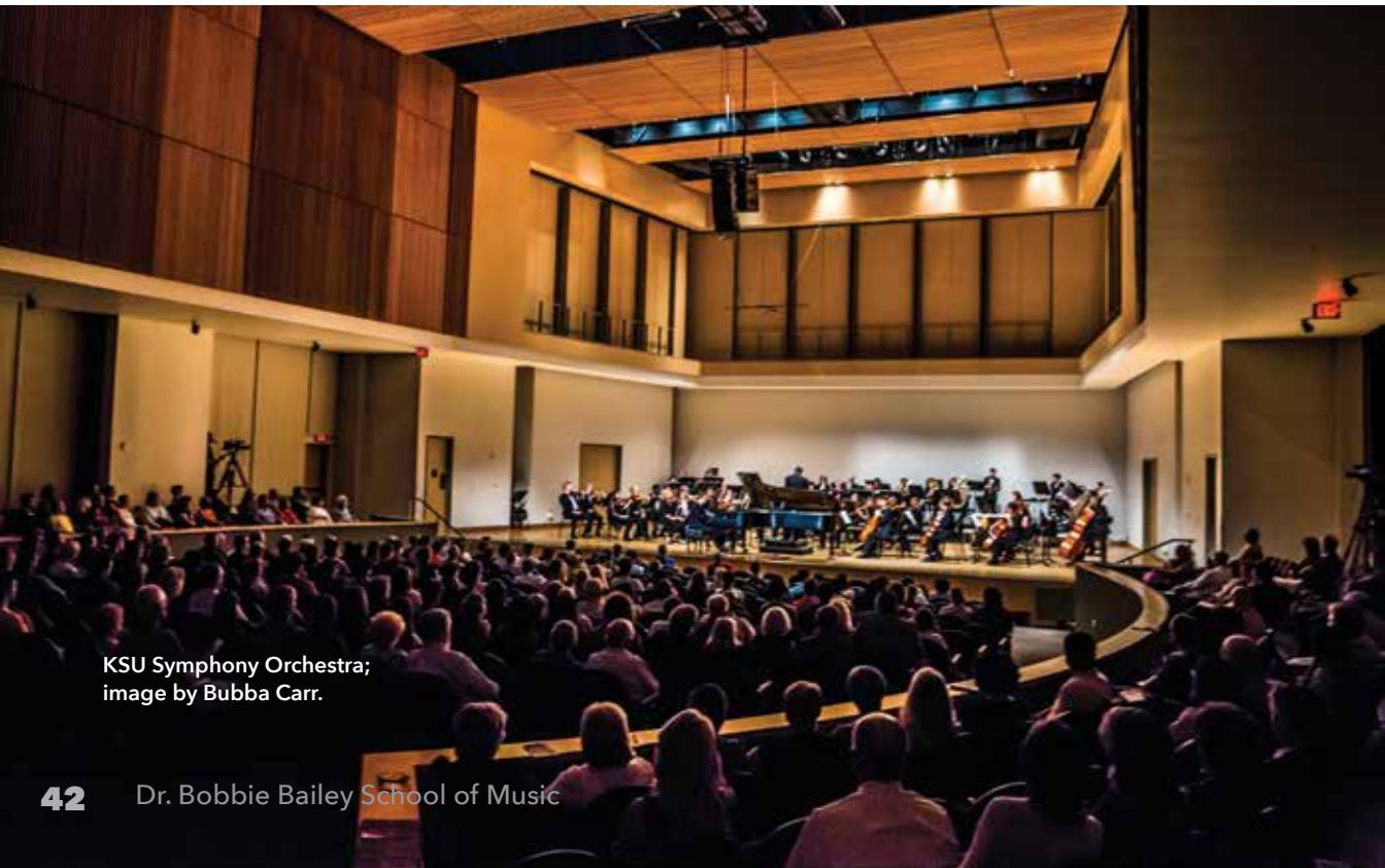
KSU Symphony Orchestra; image by Bubba Carr.