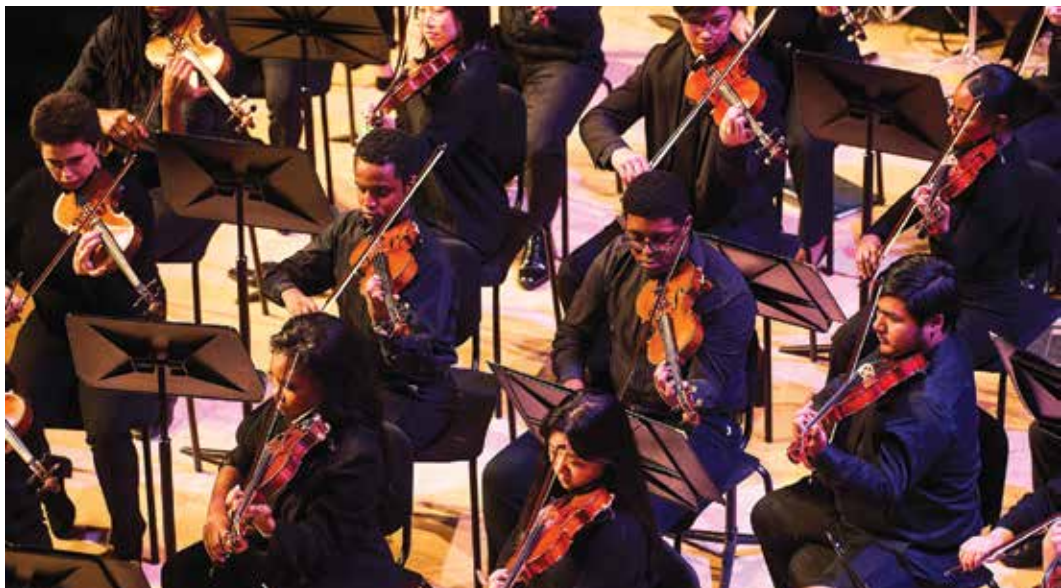
KSU Symphony Orchestra