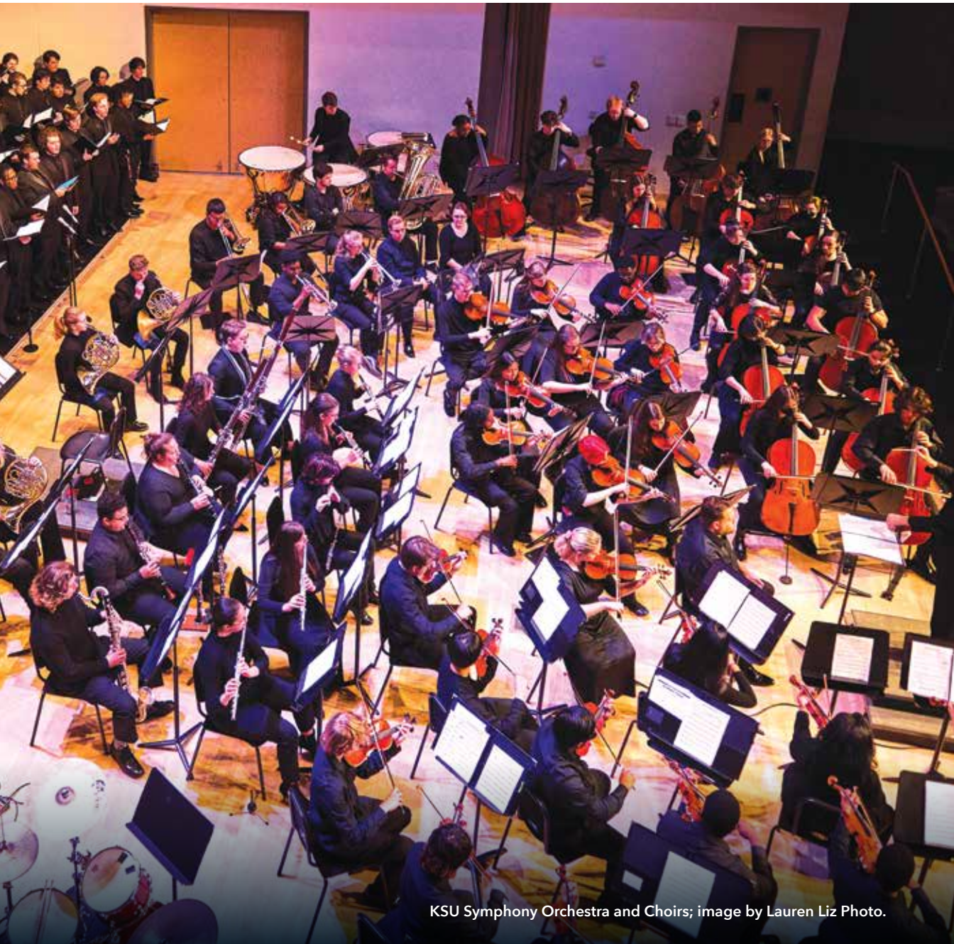
KSU Symphony Orchestra and Choirs