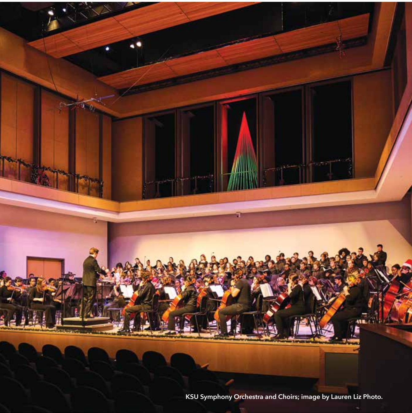
KSU Symphony Orchestra and Choirs