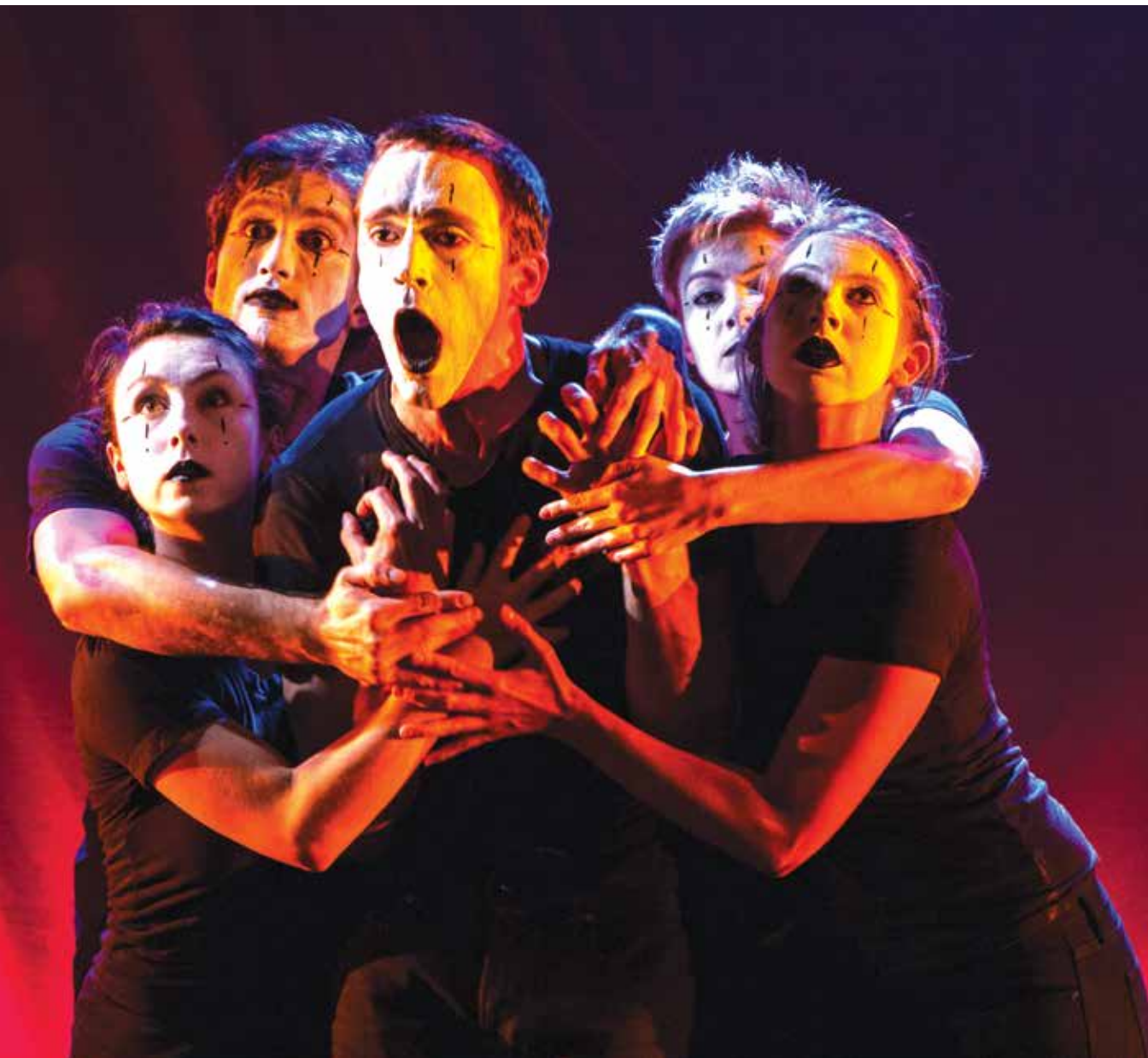
Broken Box Mime Theater Company