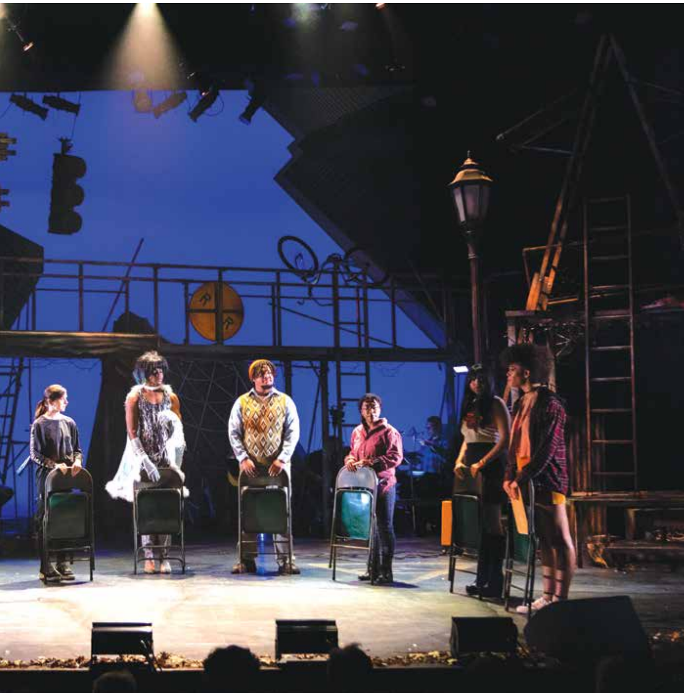
Cast of Rent ; image by Casey Gardner Ford.