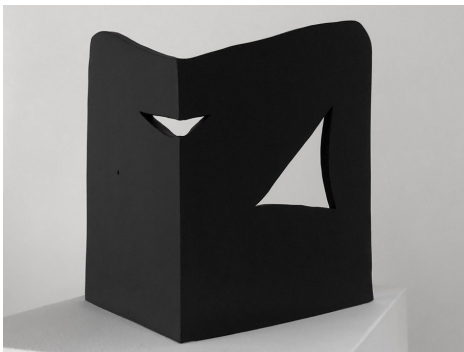
Reclining Figures III Sculpture, 2021 Amy Pleasant fired and painted clay, 13.5 x 10.5 x 10.5 x 0.5 in.

"It was amazing to make work in the classroom alongside the students. I was able to work on my own pieces, but I also liked being able to watch the students interacting with the professor. Being a part of the class was very cool, and, two months later, I am seeing the benefits of the residency in my studio at home." Amy Pleasant Artist in Resident, Fall 2021