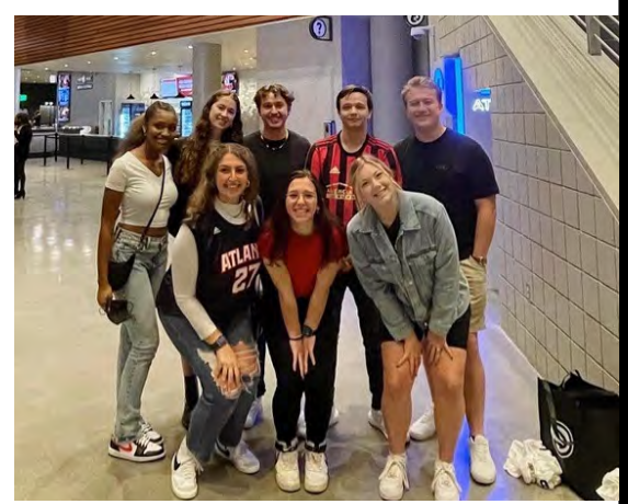
Atlanta United Game

We also attended an Atlanta Hawks basketball game where our members enjoyed a basketball game and learned about internship and job opportunities available at State Farm Arena