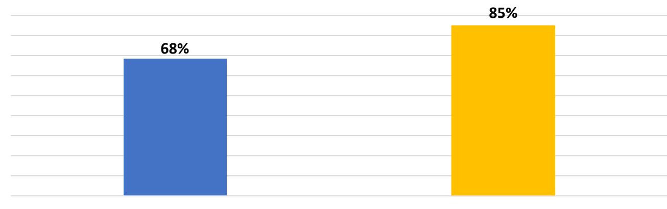
Figure 3: College Entrance Rates for Public School and GOAL Scholarship Students