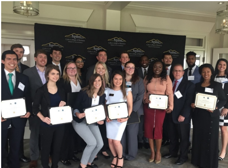
IAEP Certificate recipients at the 2019 School of Accountancy Honors Banquet

Internal Audit and related courses are thriving at KSU. In the 2018-2019 academic year thirty-five students successfully completed the three required undergraduate courses to receive the IAEP Certificate awarded by the Institute of Internal Auditors. Twenty-Four students completed the Master of Accounting specializing in Audit/Advisory to also earn their IAEP Certificate.