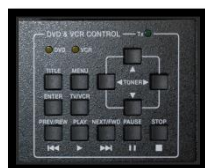
Figure 3 - DVD and VCR Control Panel