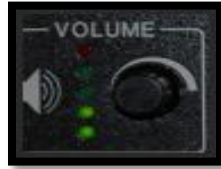
Figure 4 - Volume Control

The volume can be adjusted by a knob on the instructor station control panel (See Figure 4).