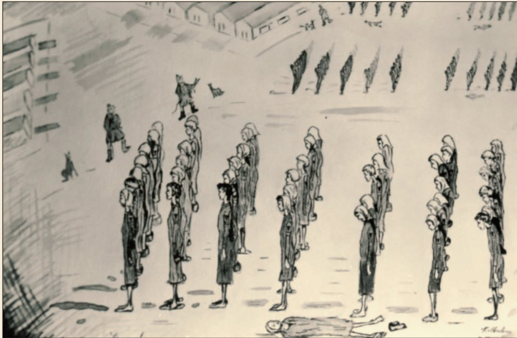
Roll-Call by unknown artist.