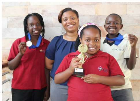
My students and me after coming in 2 nd at the World Scholars Cup competition. We are heading to Singapore in June for the 2 nd round.

Teaching internationally brings a world of experience I would not have had otherwise. My eyes have been opened, and it only makes me curious about what experiences there are to be had in other countries.