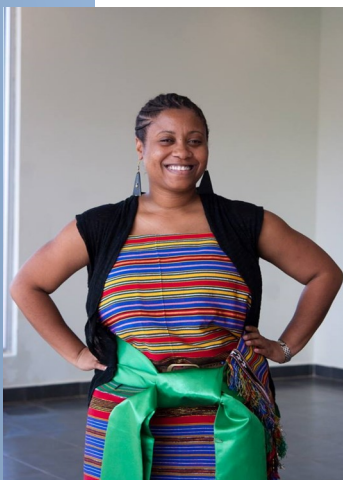
Ugandan day celebrations at school. I am wearing a traditional Ugandan outfit called a Gomesi.