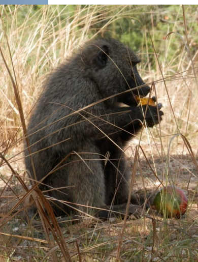
Baboon who stole my mango.

My time in Kampala, Uganda, has been priceless so far. With only two months left until the end of the school year and my first year as a teacher, things are already feeling bitter sweet. I work for a great school, with wonderful, welcoming co-workers and students who bring twenty different cultures into my classroom each week—talk about cultural diversity! They bring new languages, beliefs, food, and customs. One may think that teaching in a certain country only exposes you to that one culture, but in an International School you can expect to meet people of many different cultures. Additionally, during the breaks, I have had the opportunity to visit other places in and outside of Uganda, such as Kenya and some of the Ssesse Islands.