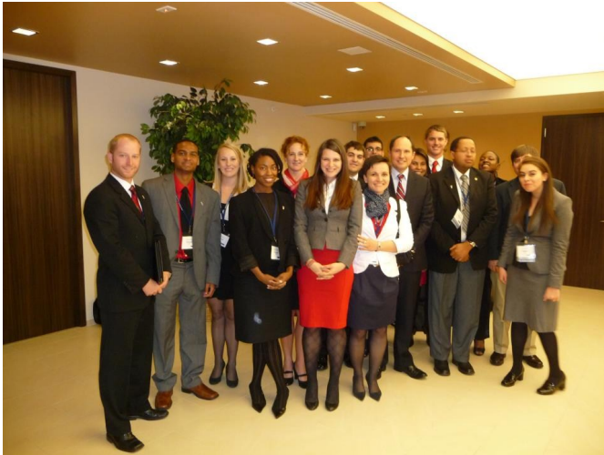
Kennesaw State University Model UN Team ready for action in New York City as part of a National Competition

Twenty-seven students from the Kennesaw State Model United Nations Team participated in the Southern Regional Model United Nations Conference and won four Outstanding Individual Delegate awards. Kennesaw students represented the United Kingdom, the Netherlands, and the Republic of Korea at the conference from November 17 th through 19 th . Kennesaw State was one of forty-five colleges and universities from across the Southeast to participate in the program and was one of the very few schools to win more than two Outstanding Individual awards. Of the 691 students participating in the event, fewer than 40 won this prestigious recognition. The fact that Kennesaw State's Model UN Team won four individual awards is a credit to the University.