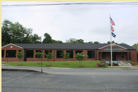
Lemon Street School Marietta, GA

More about the project can be found here .