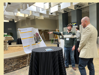
"'They're All Gone': The 1972 Munich Olympic Massacre and the Usage of the Media by Palestinian Terror Groups"