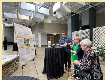
"The Fall of the Galleenists and the Wall Street Bombing of 1920"