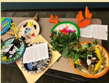
Collaborative Art Event 3/22