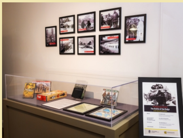
Exhibit #2 from "The Beginning of the End: The Battle of the Bulge."