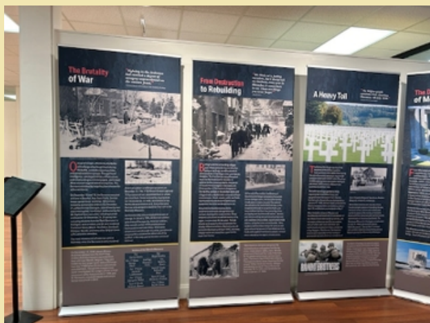
Exhibit #1 from "The Beginning of the End: The Battle of the Bulge."

The exhibit can be found in the Athenaeum Gallery on the 2nd floor of the Sturgis Library.