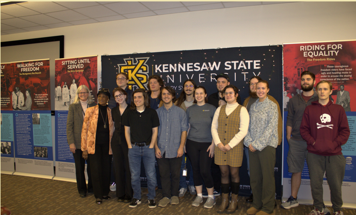
Group photo from the "The Fight for Civil Rights" exhibit.

This exhibit will become part of the MARB traveling exhibit program in 2025.