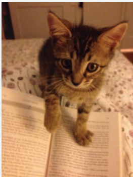
Frankie, Ashley's new kitten!