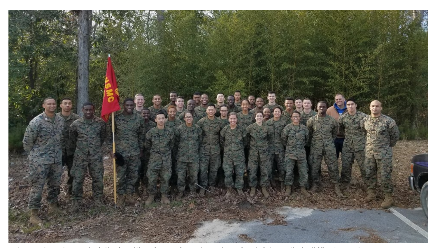
The Marine Platoon is full of smiling faces after a long day of satisfying, albeit difficult, work.

Both the hike and SULEs were done using the land on Camp Westminster in Conyers, GA. Camp Westminster and the Atlanta Region Marine Platoon have had an ongoing partnership for over 5 years thanks to a former Marine Option from the platoon. The community service itself serves as a way for the platoon to not only get away from the struggles and monotony of everyday college life, but also to get in touch with the civilians they one-day hope to protect. The platoon visits Camp Westminster every semester and plans to keep the relationship alive and well by providing their time, energy, and sweat whenever possible.